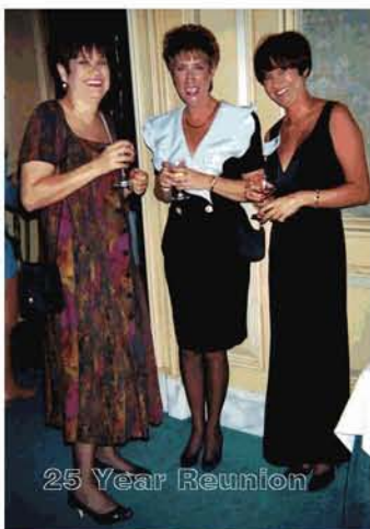
25 Year Reunion