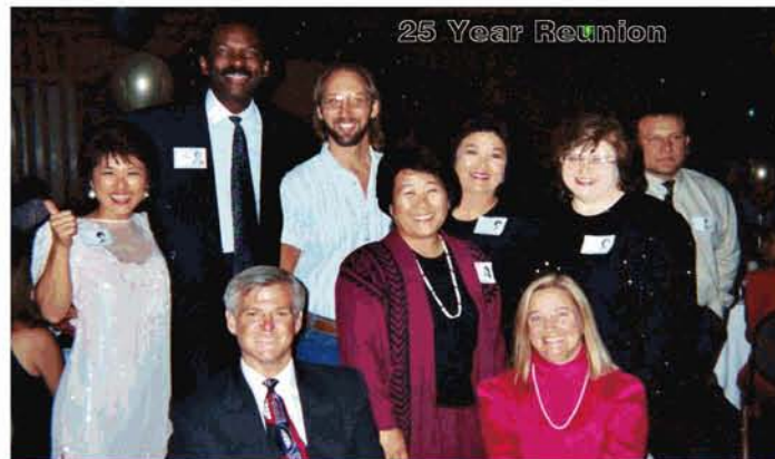
25 Year Reunion

I just had to say I am in awe of all the work you and your wife have put into the class website. I was just looking at all the new things you have added. I am just glued to my chair as I am looking at all