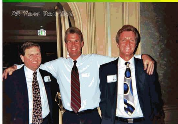
25 Year Reunion