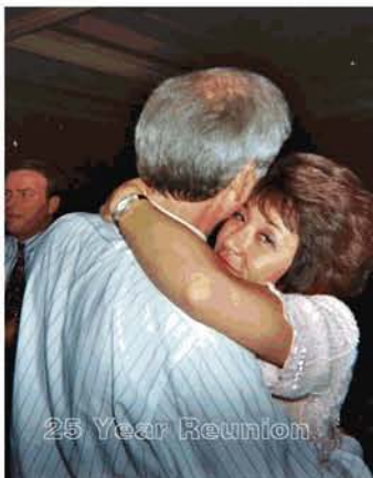
25 Year Reunion